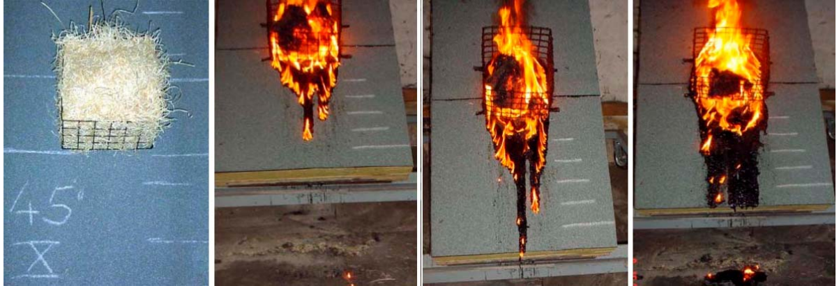
Typical fire test of waterproofing materials in Germany.

Today in Germany are at least 2 billion square foot of extensive green roofs built and there is no fire recorded related to a green roof. This research and further studies showed certain risks (i.e. sparks caused by burning grasses which can spread over the green roof by wind) which are minimized by clear definitions of green roof details and roofing details for green roof. There are considerations in building codes, German and European standards (DIN/EN). The FLL guideline always represents the latest State-Of-The-Art in addition to the above mentioned standards. In Germany you typically get a 10-20% discount on the fire insurance when a seamless extensive green roof is installed.