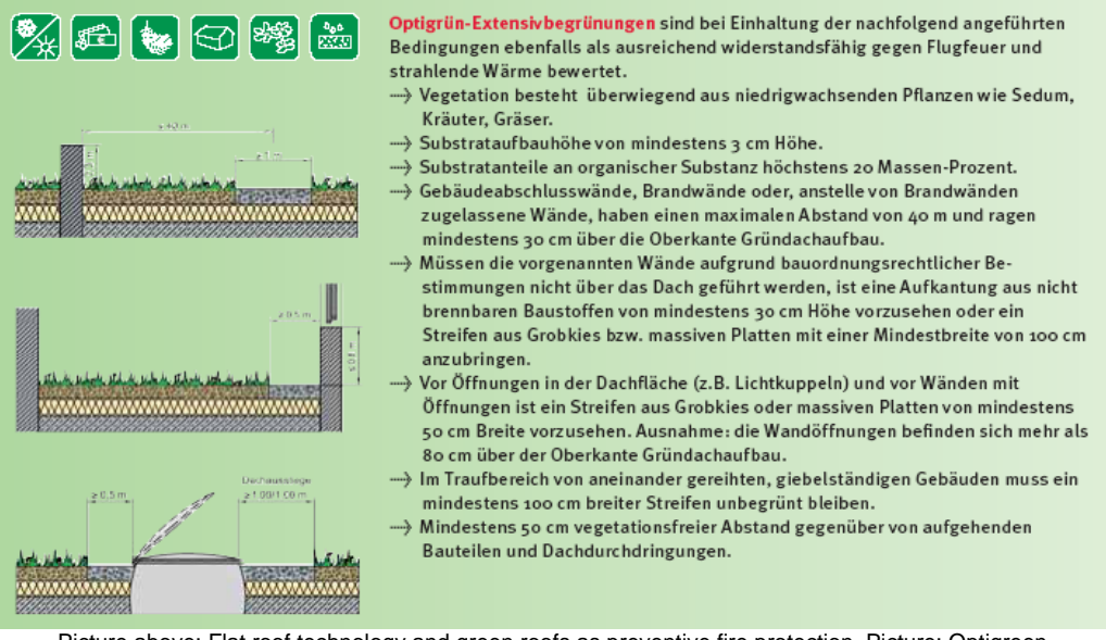
Picture above: Flat roof technology and green roofs as preventive fire protection.

Today in Germany are at least 2 billion square foot of extensive green roofs built and there is no fire recorded related to a green roof. This research and further studies showed certain risks (i.e. sparks caused by burning grasses which can spread over the green roof by wind) which are minimized by clear definitions of green roof details and roofing details for green roof. There are considerations in building codes, German and European standards (DIN/EN). The FLL guideline always represents the latest State-Of-The-Art in addition to the above mentioned standards. In Germany you typically get a 10-20% discount on the fire insurance when a seamless extensive green roof is installed.